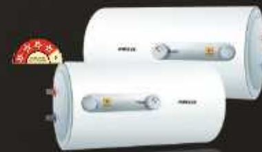
ES 15/25H-E1 (RH/LH)