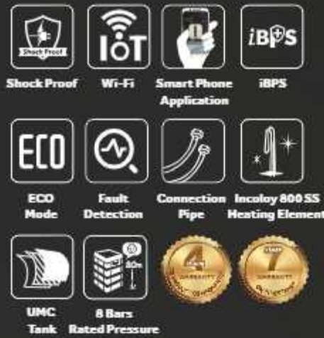
ES 15 /25V-SD Wi Fi