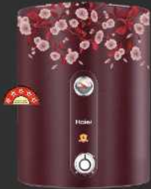
ES 10/15/25V-COLOR FR