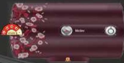
ES 15/25H-COLOR FR