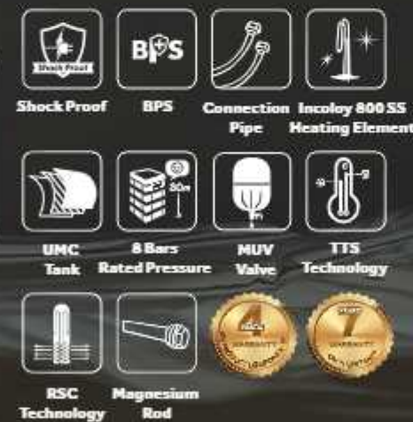
ES 10/15 /25V-S1